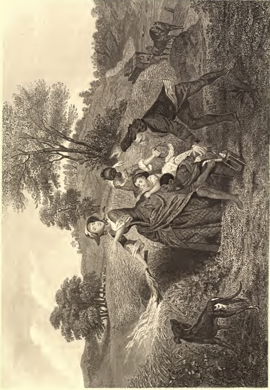
THE PEASANTS OF THE MOUNTAINS OF SWITZERLAND, WITH THEIR CATTLE AND HORSES.

Engraved from the original painting by J. M. W. Turner.